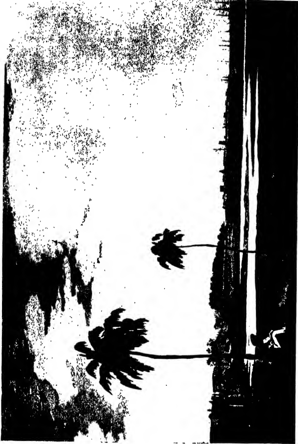
VIEW OF FORT ST GEORGE FROM ACROSS THE COOYM. After a water-colour sketch in the Ouseley Collection at the India Office.